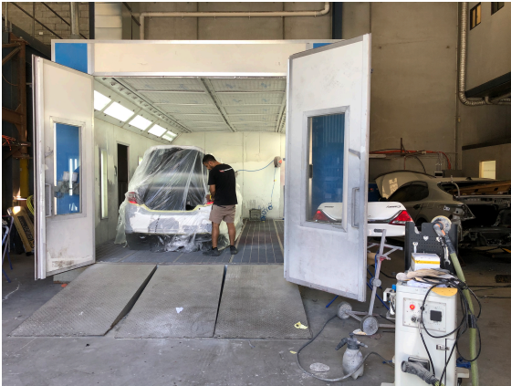
Spray painting booth