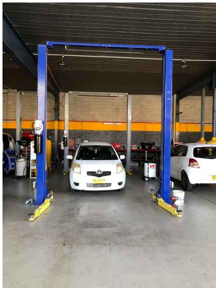
Close up of the mechanical repair work bays