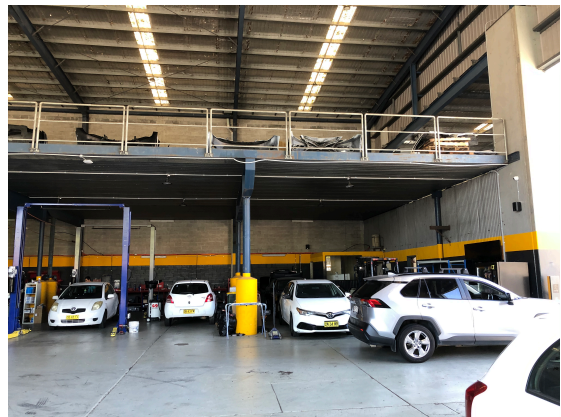
Mechanical repair work bays